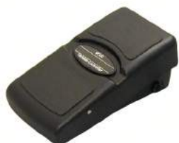
VC90/ 腳踏開關 Speed Control Foot Pedal Suitable for EXP-120/230