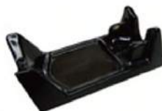
TRCO2/ 工具擱置塊 Handpiece Cradle