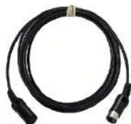
KE50-155/ 延伸線 Handpiece extension cord Length : 3.0 meters